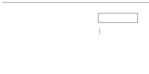
RLC-2 Revision C Boards

Pin #1 (Striped side of the cable) is located on the lower left side of J8